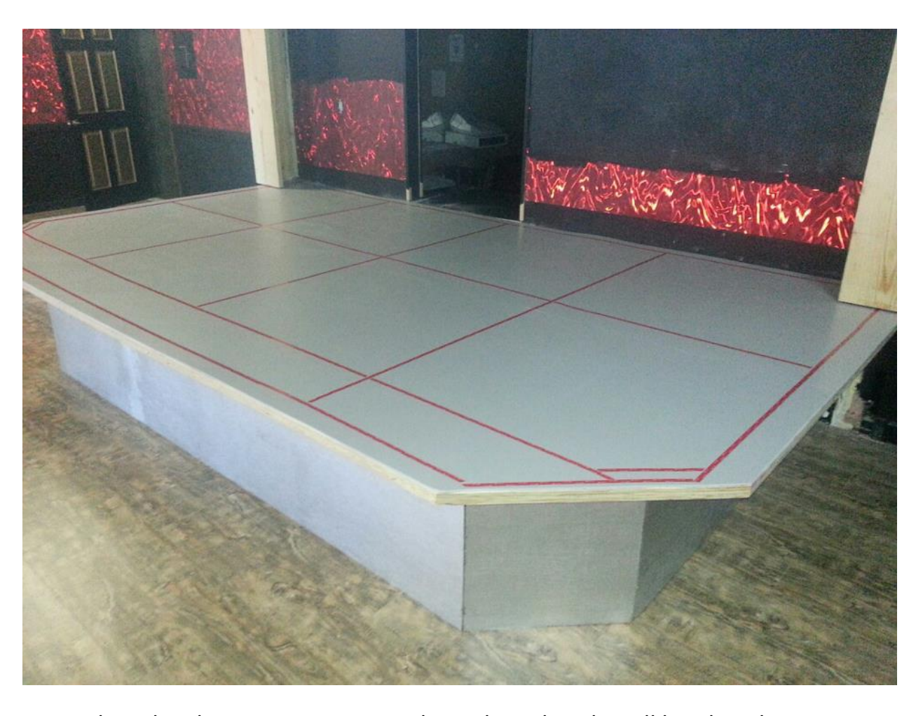
Step three lay down 3M VHB tape where the gel packs will be placed. See more photos below.